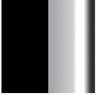
Black/Polished Aluminum - BPA

Digital: Not all screens are calibrated the same, and therefore, colors will appear differently between screens.